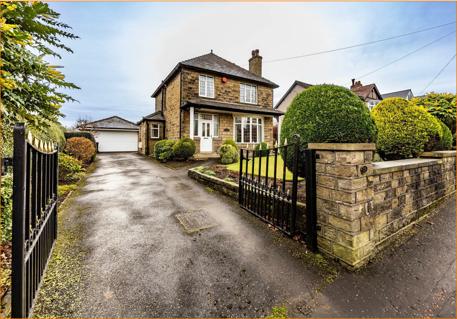
Fixby Road Fixby, Huddersfield, HD2 2JL